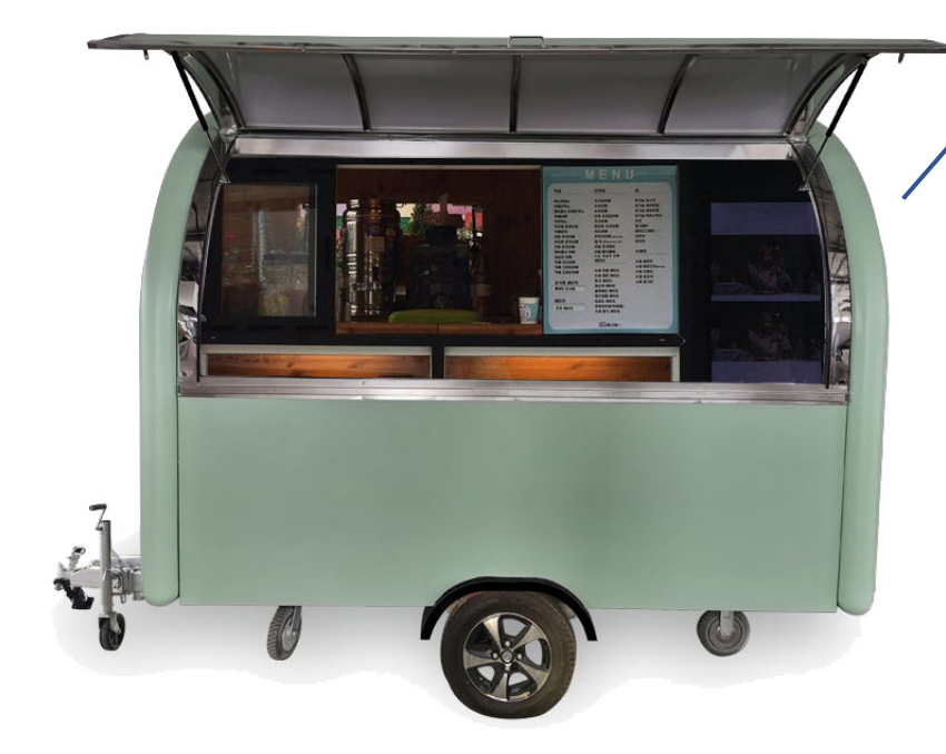
For Kiosk B Space, tenant is able to place a Food Truck on site.