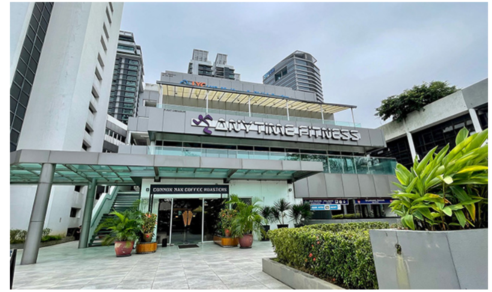
TOWER BLOCK PLAZA VADS