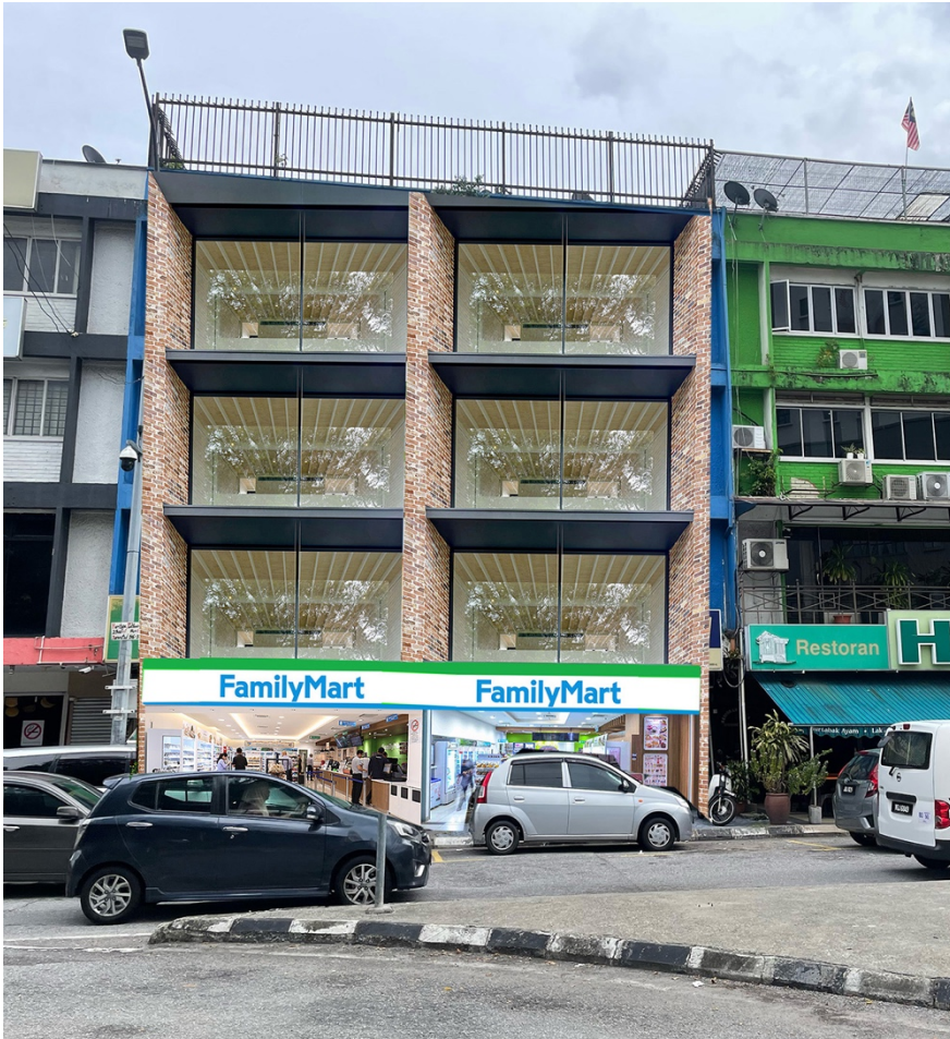
Proposed Exterior Design