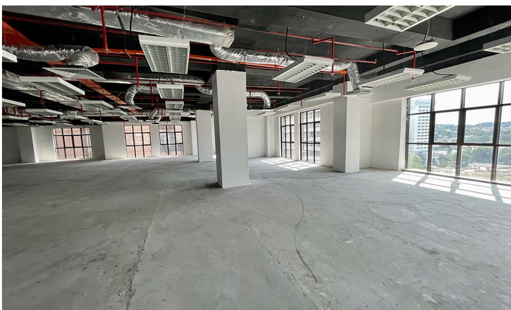
8 th Floor Office