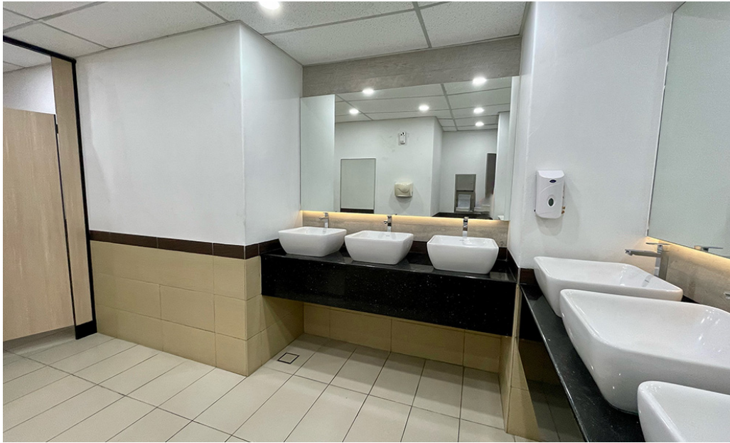
4 th Floor Toilet