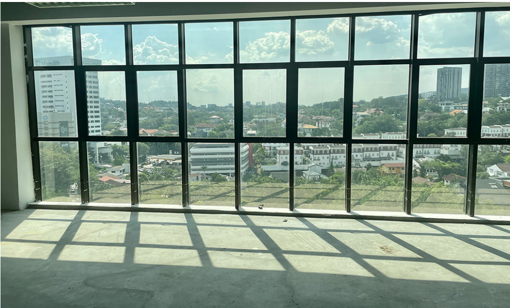
8 th Floor Office