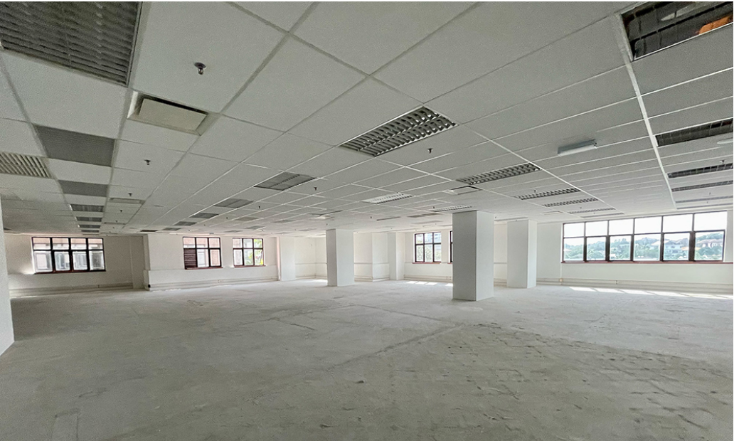
4 th Floor Office