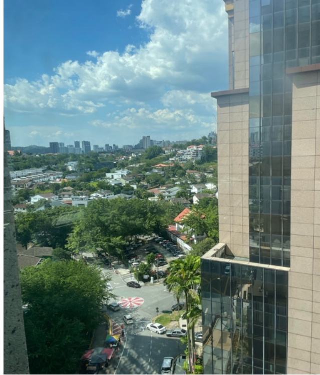
View from the office on the 9 th Floor