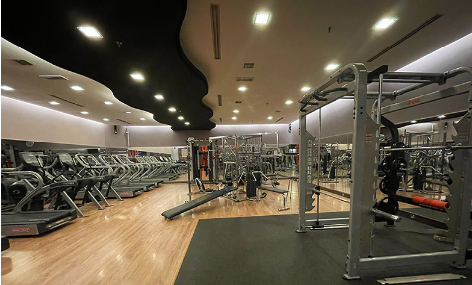
GYM @ LEVEL 41