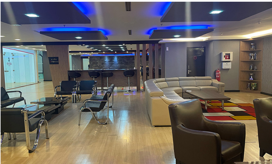
LOUNGE @ LEVEL 40