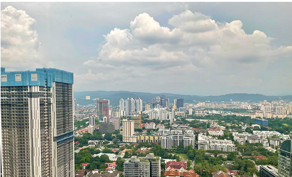
VIEW FROM 39 TH FLOOR OFFICE