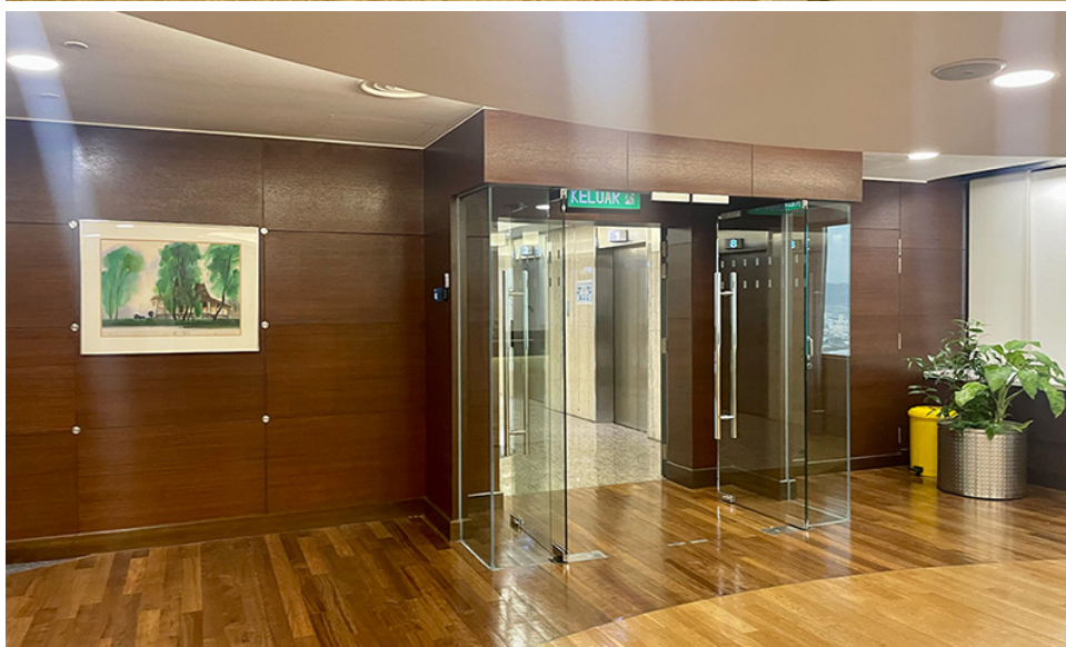
ENTRANCE TO CORPORATE OFFICE