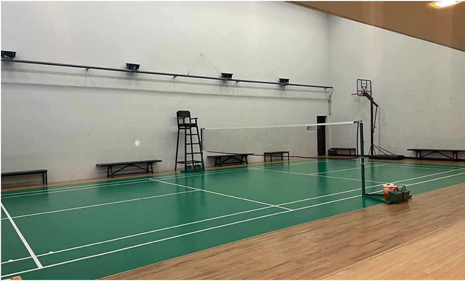
BADMINTON COURT @ LEVEL 40