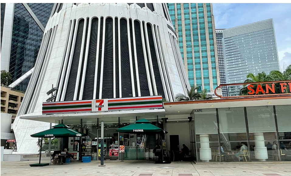
UG FLOOR F & B OUTLETS