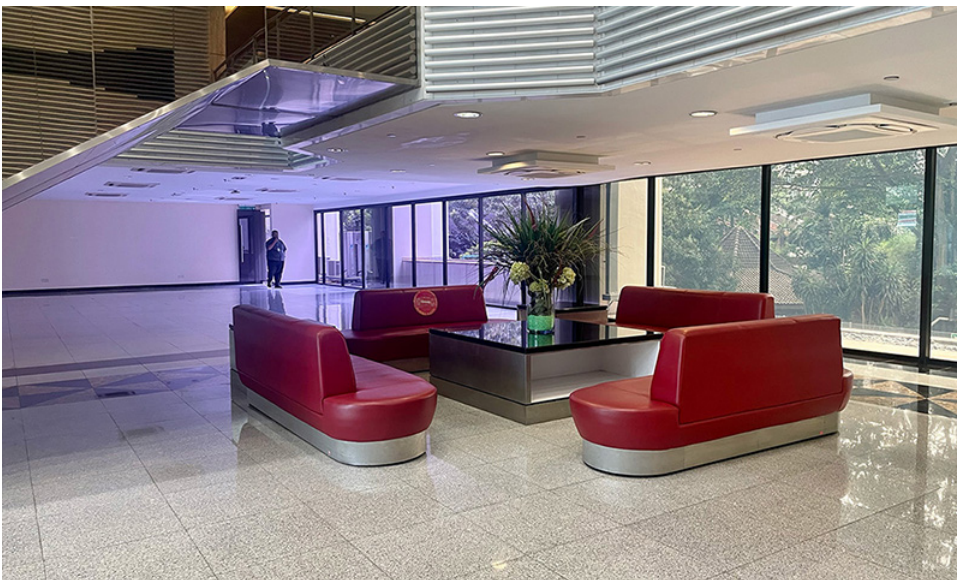
WAITING AREA ON UG FLOOR