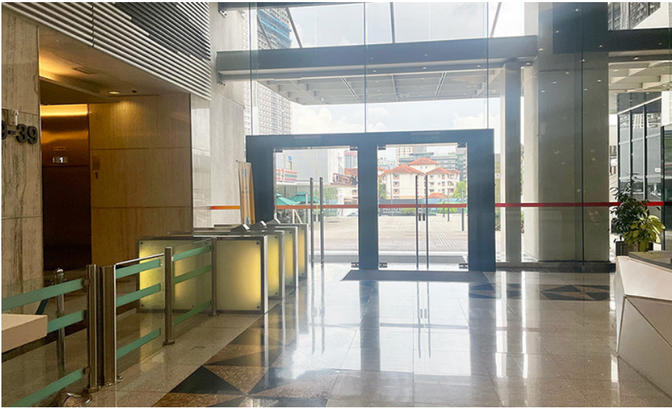
LIFT LOBBY ON UG FLOOR