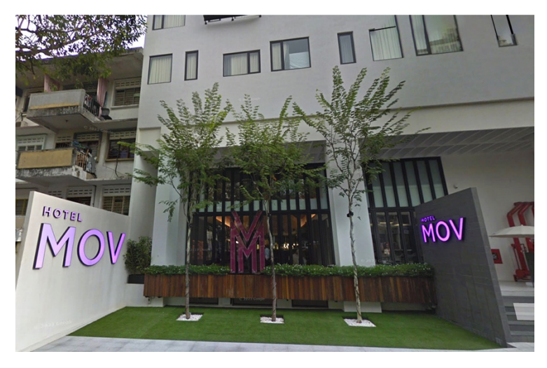
MOV Hotel, located opposite the subject property.